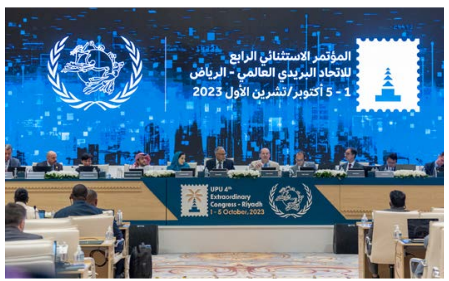
1 October 2023 - Plenary on the opening of the UPU to increase engagement with wider postal sector players (WPSPs)

On October 5, 2023, the Universal Postal Union concluded its fourth Extraordinary Congress in Riyadh, Saudi Arabia. The five-day event, which brought together postal plenipotentiaries from around the world, saw several historic agreements made, including plans to increase the UPU's engagement with wider postal sector players, new climate action targets, the modernization of postal financial services, and increasing the UPU's regular budget ceiling to provide the organization with additional financial resources.