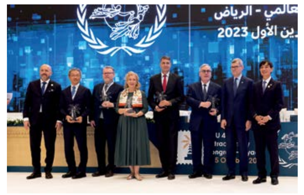
5 October 2023 - Winners (from left, Japan, Austria, Switzerland, Germany and France) of the Postal Excellence Awards.

This is vital not only to the survival of the posts themselves but to the countries in which they operate. The UPU's research found that countries that benefited from