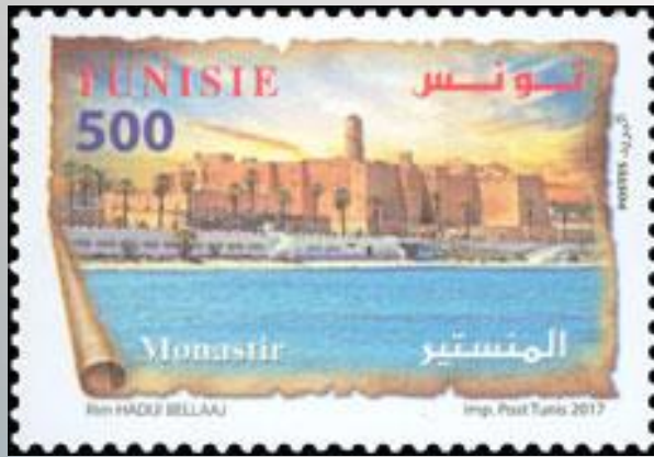
Tunisian Cities : Monastir