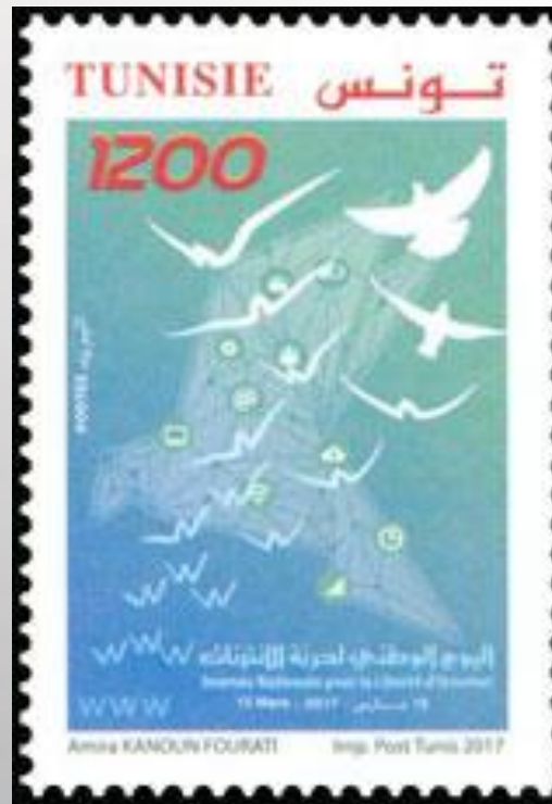
National Day for Internet Freedom