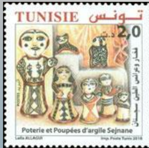
Pottery and Clay Dolls of Sejnane