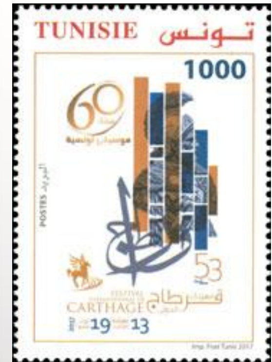
The 53rd Session of Carthage International Festival