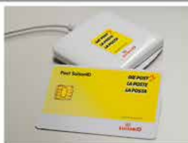
Government services (identification)