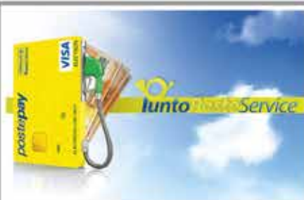
Prepaid cards for migrants