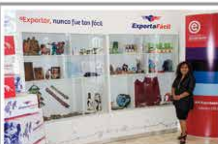
Trade facilitation (MSMEs)