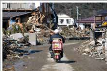
Delivery of emergency aid